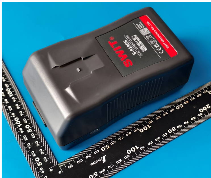
Fig. 2 – Back view of Power Bank 表2-电池反面视图